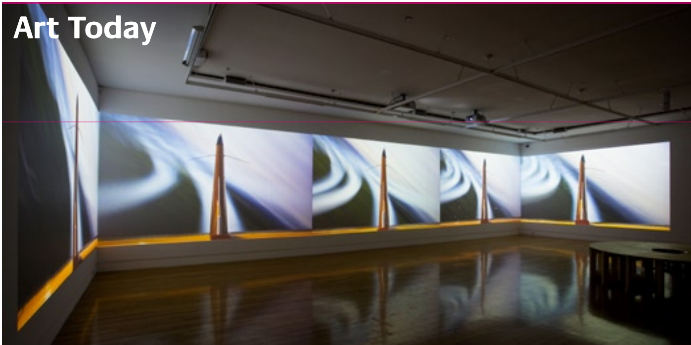
Image: Alex Monteith, Composition with Royal New Zealand Air Force Red Checkers for five channel video installation 2009, five channel video and sound installation. Filming and production commissioned by TVNZ's New Art Land series Installation initiated by Te Tuhi Centre for the Arts with support from The University of Auckland Special thanks to the Aotearoa Digital Arts Network, The Physics Room and Artspace, Auckland

Art Today is a year-long course about contemporary art. This course acts as an introduction to the inspiring and provocative world of art today—from the unique perspective of Auckland, New Zealand, in the 21st Century. Learn to negotiate the complex system of politics, practice, philosophy, economics and jargon which contemporary art offers the viewer and in doing so become an active participant in your arts community.