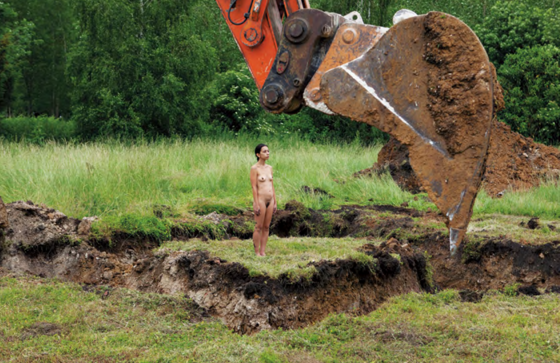
Regina José Galindo Tierra (Earth) , 2013 (video still) courtesy of the artist