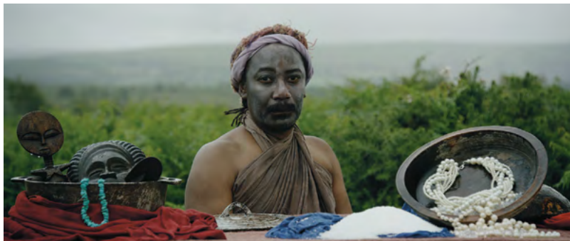
John Akomfrah Tropikos, 2016 (video still) single channel colour video, 51 sound 36 minutes 41 seconds

By bringing to Aotearoa works from all corners of the world, the exhibiting artists invite us to share in numerous knowledge systems and histories which, as light emanating from their eyes, can help illuminate our path.