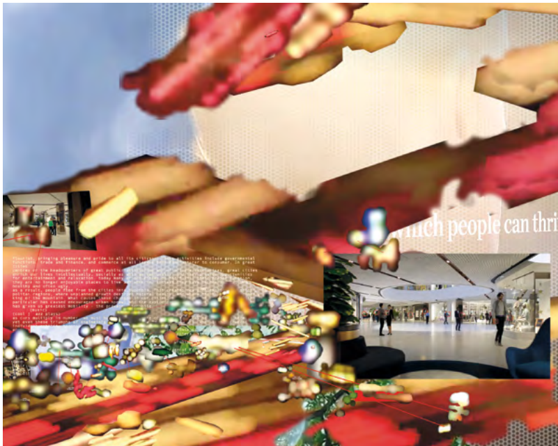
Hikalū Clarke Accurate Community Projections, 2018 commissioned by Te Tuhi, Auckland

For the Te Tuhi Billboards, Hikalū Clarke co-opts the visual vocabulary of advertising and retail developers to question how these 'public' arenas entrench hegemonic power and operate as hubs for data procurement. Situated on the outer wall of Pakuranga Plaza, Clarke's CG images reflect the fortress-like construction of these mega structures. Comprised of abstracted details taken from video stills, the billboards speak a network language linked by captions taken from yearly performance reports. The language used is both painfully optimistic, and at times inhuman and cold.